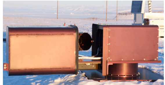
Above: Rooftop solar tracker, controlled by ephemeris calculations with image/aperture correction. Left: 250cm OPD FTIR interferometer. At bottom is solar beam entrance, at

The FTIR measures several dozen chemical components in the atmosphere. These trace gases are important for understanding the accumulation of greenhouse gases, ozone depletion chemistry, transport of pollutants and biogenic emissions. These are signs of and can have far reaching effects on climate and air quality and how they are changing.